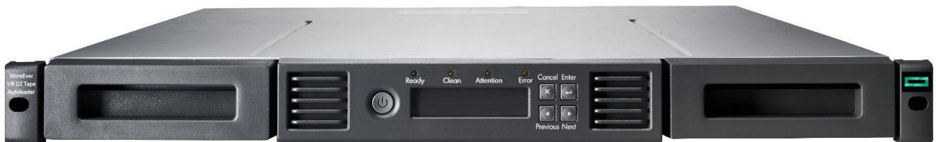
HPE StoreEver MSL 1/8 Tape Autoloader

Quickly and simply manage the tape media both in and out of the library with the standard bar code reader, configurable mail slots, and removable magazines. If a tape were lost or stolen, protect important business data from unauthorized access with data encryption options. MSL investment protection and uncertain data growth are easily managed within the MSL library portfolio. Quickly increase capacity and/or performance with tool-free drive upgrades in the MSL 1/8 Tape Autoloader or MSL2024 Tape Library, or move tape drive kits to the MSL3040 or MSL6480 for library scalability and additional enterprise class features. Proactively receive detailed information about your MSL Tape Automation with HPE StoreEver TapeAssure Advanced, a licensed feature of CVTL. Information about the library, drives, and media are all monitored for utilization, operational performance, and life and health information. Prevent problems before they occur by proactively receiving notification if any library, drive or tape media parameters fall below Hewlett Packard Enterprise recommended standards.