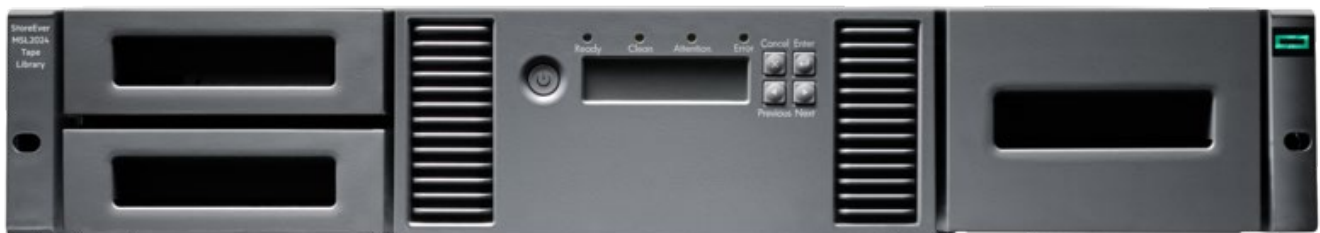
HPE StoreEver MSL2024 Tape Library